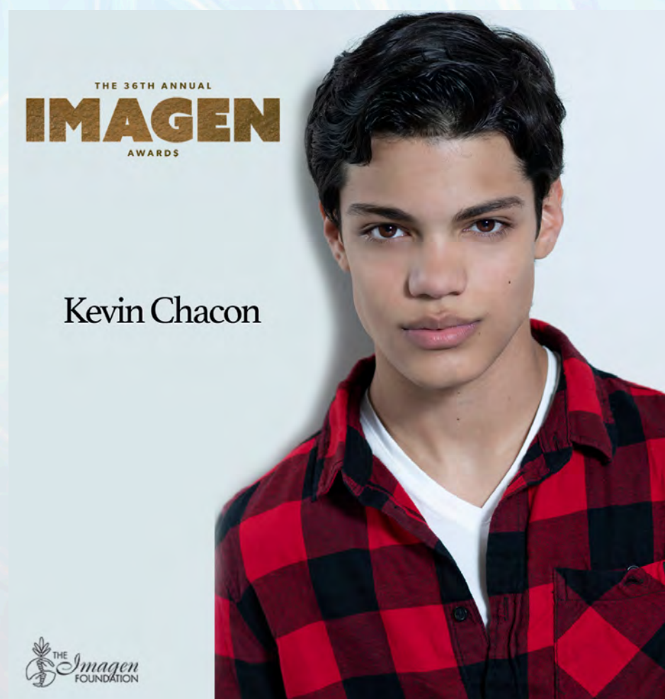
Imagen Award Nominee