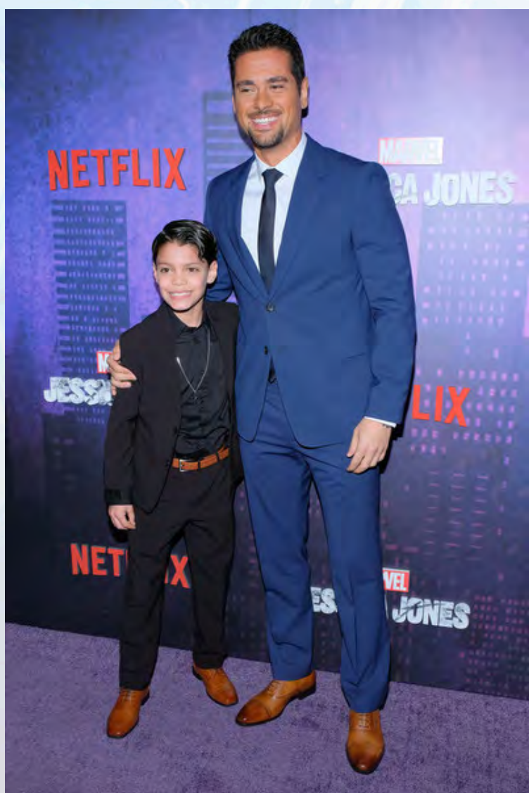
Netflix "Jessica Jones"